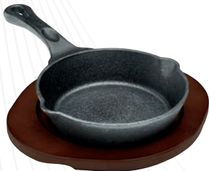
CAST-6UL with CAST-6