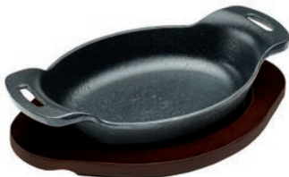
CASM-7OUL with CASM-7O