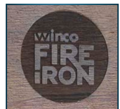
Engraved logo on bottom